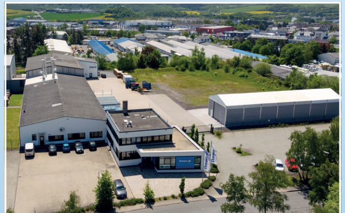
Durwen factory II, Mayen