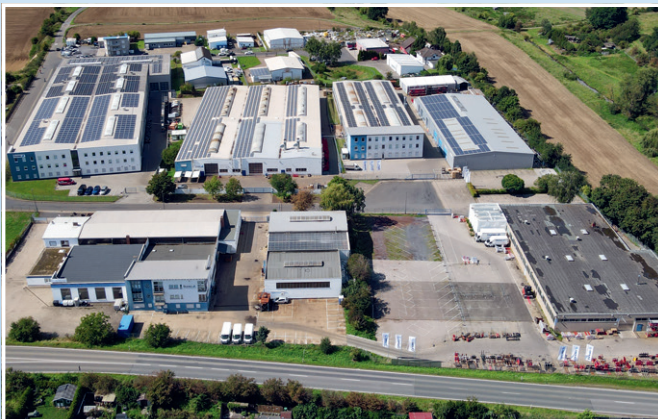
Durwen factory I, Plaidt