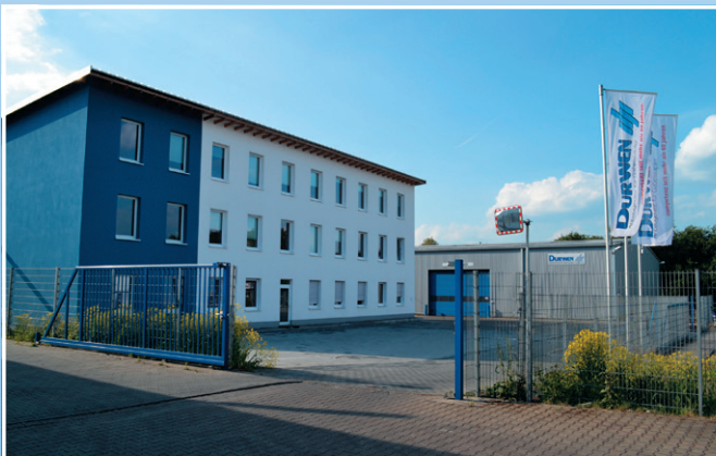
Durwen research and development centre